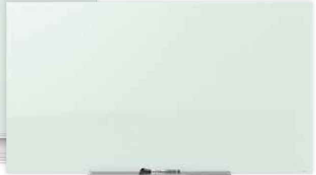
InvisiMount™ Glass Board

and receive either a free Infinity™ Glass Cubicle Board or a free Infinity™ Glass Desktop Dry-Erase Pad