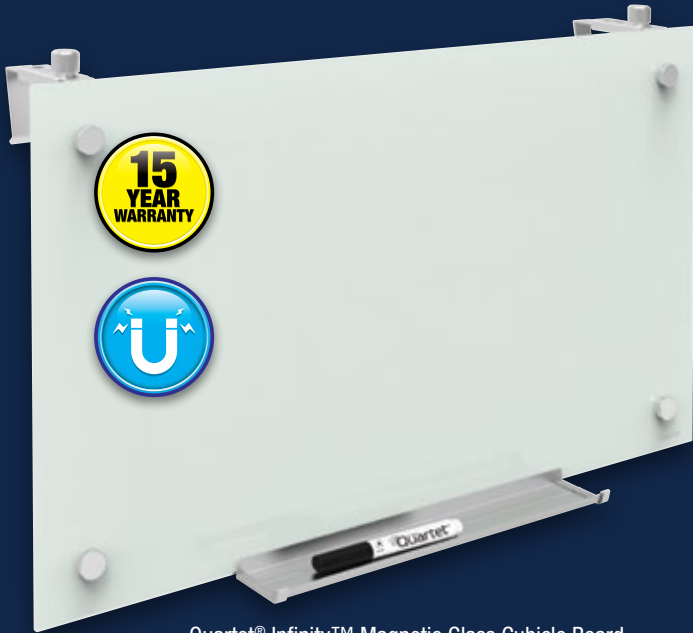
Quartet® Infinity™ Magnetic Glass Cubicle Board